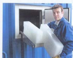
Container + Block ice